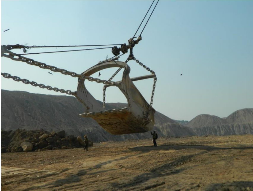
Figure 1. 3: A large dragline bucket

In dragline operation bucket is an essential component. There are different types of bucket available for the draglines provided by different manufacturers. The bucket ought to be matched for maximum productivity in the rugged field conditions.