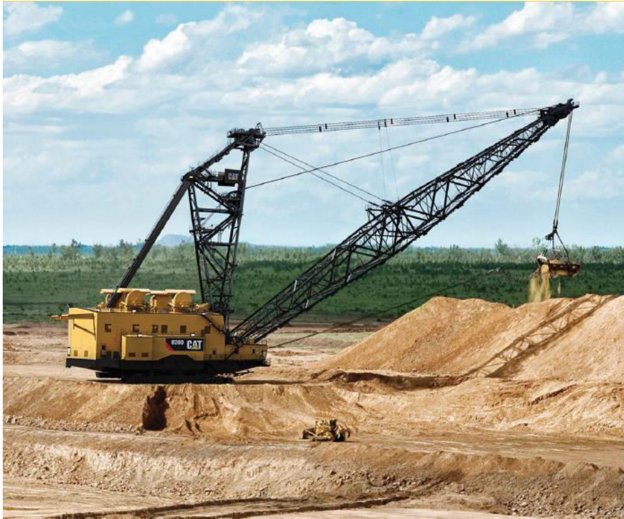
Figure 1. 1: Dragline 8200 model in mine

For most mines which deploy dragline, the dragline is the most critical equipment from the point of view of its operation and productivity. The mining profitability is profoundly linked to the dragline productivity. The productivity of a dragline bucket is dynamically changed with the aid of various conditions evolving from operational, environmental, and human-based requirements. Also, they are governed to a great extent by the indiscretions and inhomogeneities in the working conditions. It has been determined that operational and resultant stress differences are critical issues that cause unstable stress to set off harm to the bucket and its working life (Golbasi and Demirel, 2015).