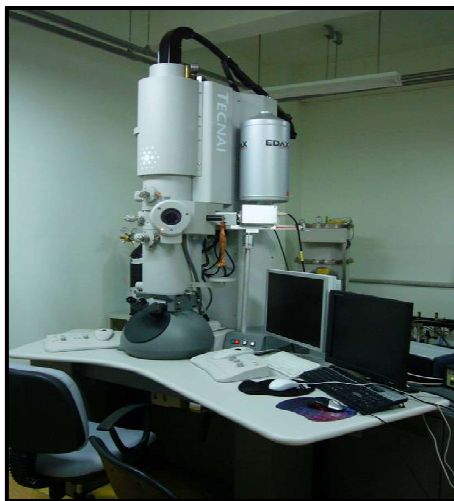
Fig.2.3. Transmission Electron Microscope (TEM, FEI TECANI G 2 20 TWIN, USA) used to determine particle structure.

Transmission electron microscopy (TEM) is a microscopic technique where a beam of electrons is transmitted through an ultra thin specimen, interacting with the specimen as they pass through.