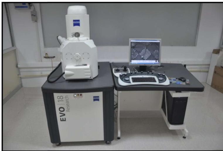
Fig.2.4. Scanning Electron Microscope (ZEISS, model EVO-18 Research) used for microstructure of the surface of the ceramics.

Microstructure of ceramics was determined using Scanning Electron Microscope (SEM) (ZEISS, model EVO-18 Research; Germany). One of the surfaces of the sintered pellets was polished using emery papers of different grades 0/0, 1/0, 2/0, 3/0, 4/0, and 5/0 successively. They were further polished on a velvet cloth using gold paste of the order 1\mu\text{m} and 1/4\mu\text{m} followed by thermal etching. In some cases, microstructural studies are carried out for fractured surfaces of the sintered pellets.