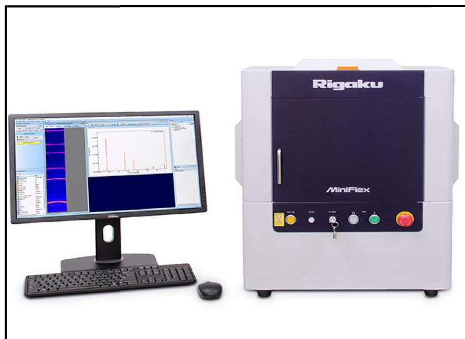
Fig.2.2. Powder X-ray diffractometer, RigakuMiniflex600 (Japan).

absence of characteristics lines of constituent oxides or any other compound between them in the XRD pattern. The XRD pattern was indexed and lattice parameter determined using least square fitting of the data using a software program 'CEL'. The X-ray analysis was performed by the usual Hanawant's method of the comparative peak matching with the standard Joint Committee on Powder Diffraction Standards (JCPDS) files. The 'd' spacing is calculated for different samples from the diffraction data obtained using Bragg's law. The 'd' value matched with those existing in JCPDS files for the identification of different phases. The X-ray analysis has been made the most popular method for the estimation of crystalline size in nano phase materials and therefore has been extensively used in the present work.