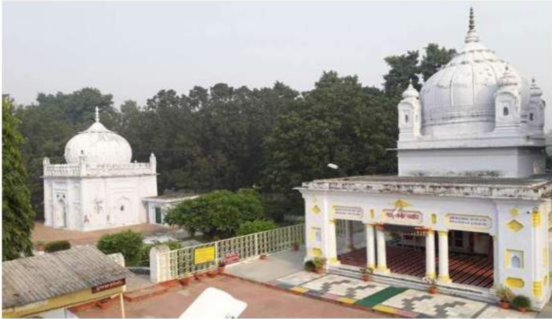
Figure 8: Kabir Mazar (left side) and Kabir Samadhi at Maghar

at Maghar. It is significant to note that the coexistence of both the shrines develops a syncretic relationship between the Hindus and Muslims of Maghar (this aspect will be studied in detail in the fifth chapter).