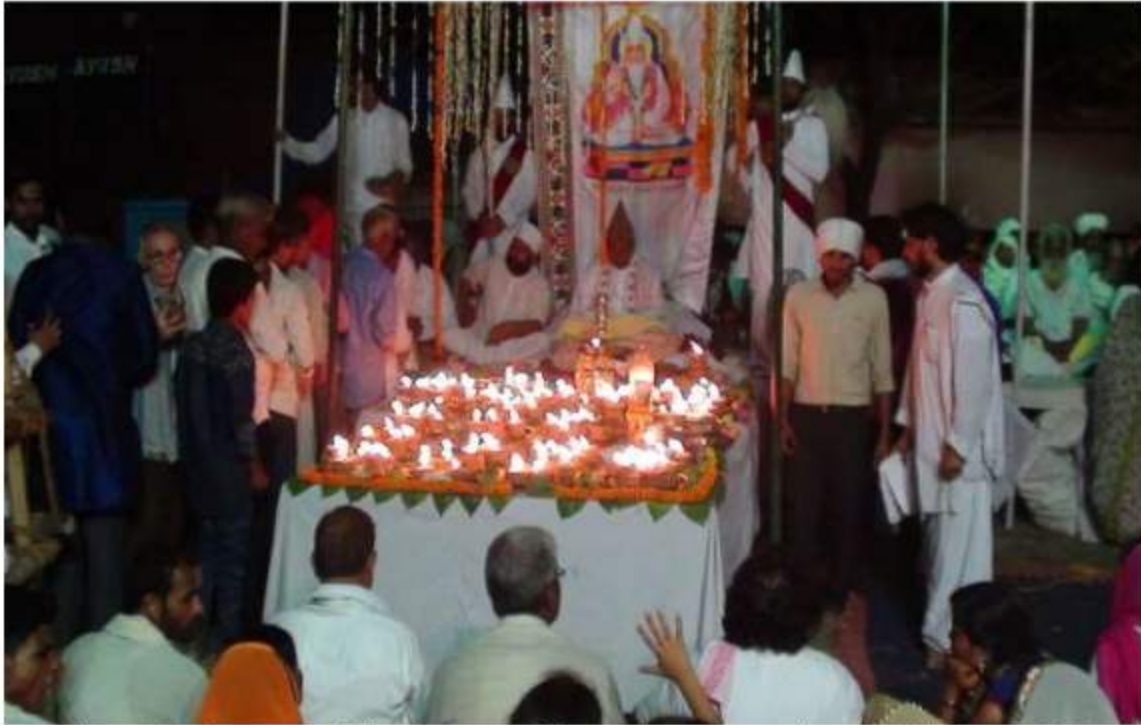
Figure 7: Performance of Chauka Arti at Kabir temple on the occasion of Kabir Jayanti 2017