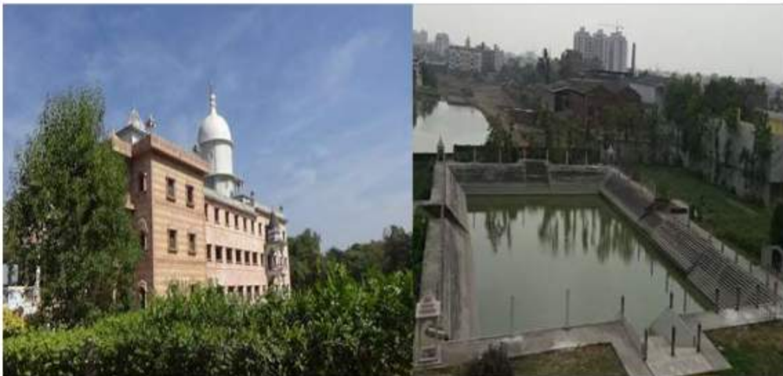
Figure 5: Lahartara Dharmadasi (Naadvansha) Kabir Temple and Pond

Uditnam Saheb raised money through donation for developing the Kabir Math and founding a temple of Kabir at Lahartara. He bought a piece of land near the pond and built a temple there in 1967.