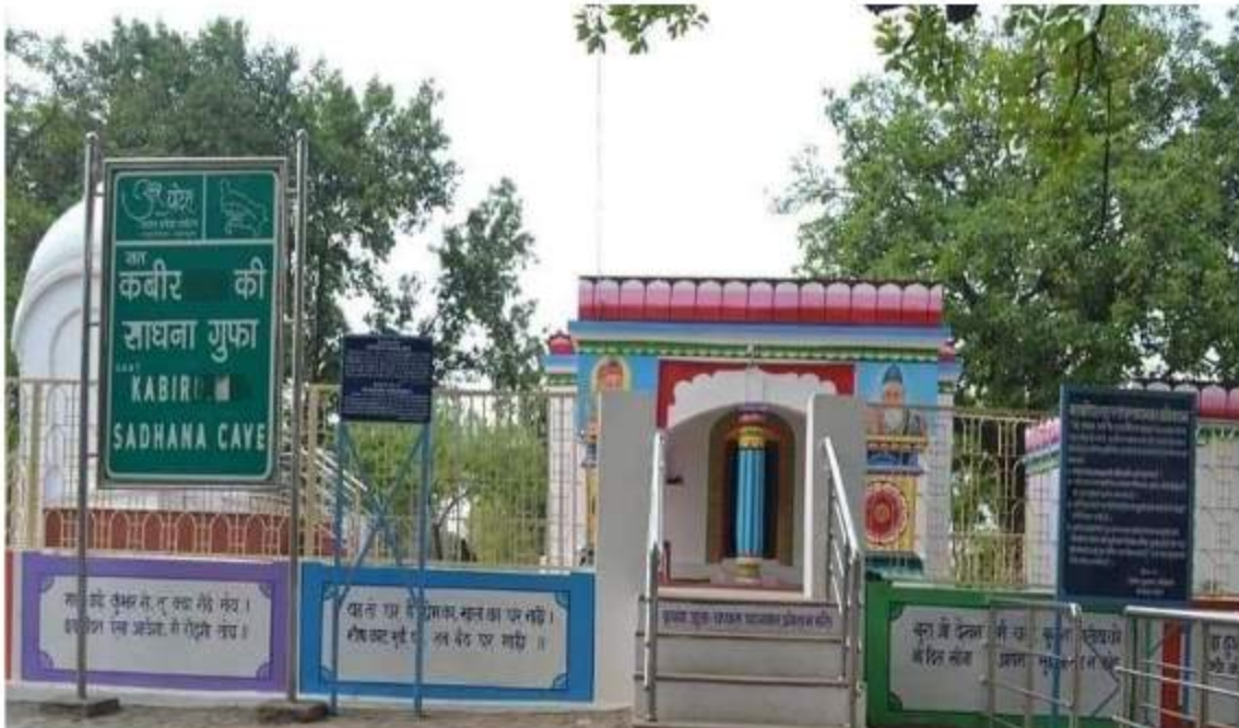
Figure 9: Cave of Kabir at Maghar

K. Dwivedi also mentions this cave: “Here, there is a bhoomidhara (a pit or hole) in the ground. The people of that place believe that Kabir used to mediate here” (p. 165). This cave has now become famous as Kabir Gufa (the Cave of Kabir), a place of Kabir’s sadhana and attracts a large number of Kabirpanthi and non-Kabirpanthi followers. According to Khadim Hussain, the importance of the cave has increased more than Kabir’s shrines as Kabirpanthi followers perceive it as the main place of Kabir’s sadhana .