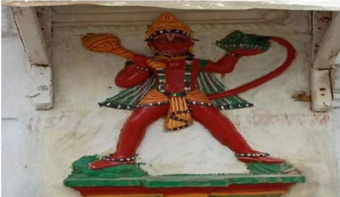
Figure 13: Statue of Lord Hanuman at Lakshmipur Bagicha Math