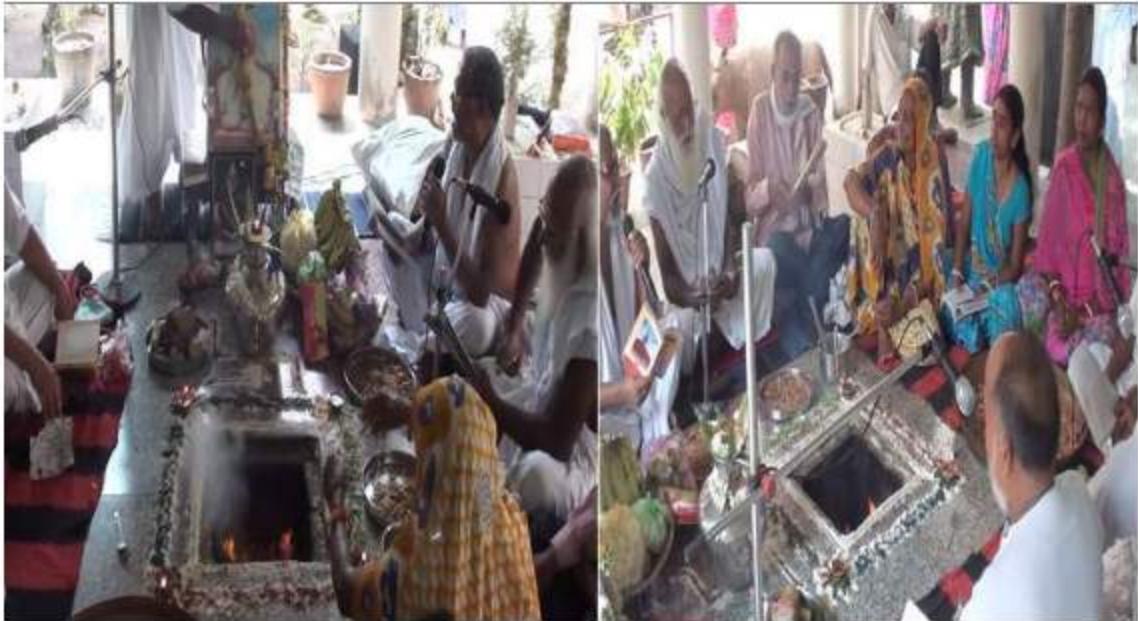
Figure 2: Performance of Bijak Path and Havan Puja at Kashi Kabir Chaura Math

Chauka Arti on people, these sects might have decided to cultivate a major ritual like Bijak Path in order to have their hold on new and old followers. Through Bijak Path , they have, on the one hand, continued to give prominence to the Bijak and on the other hand, they also serve the aspiration of those followers who want rituals as a form of worship.