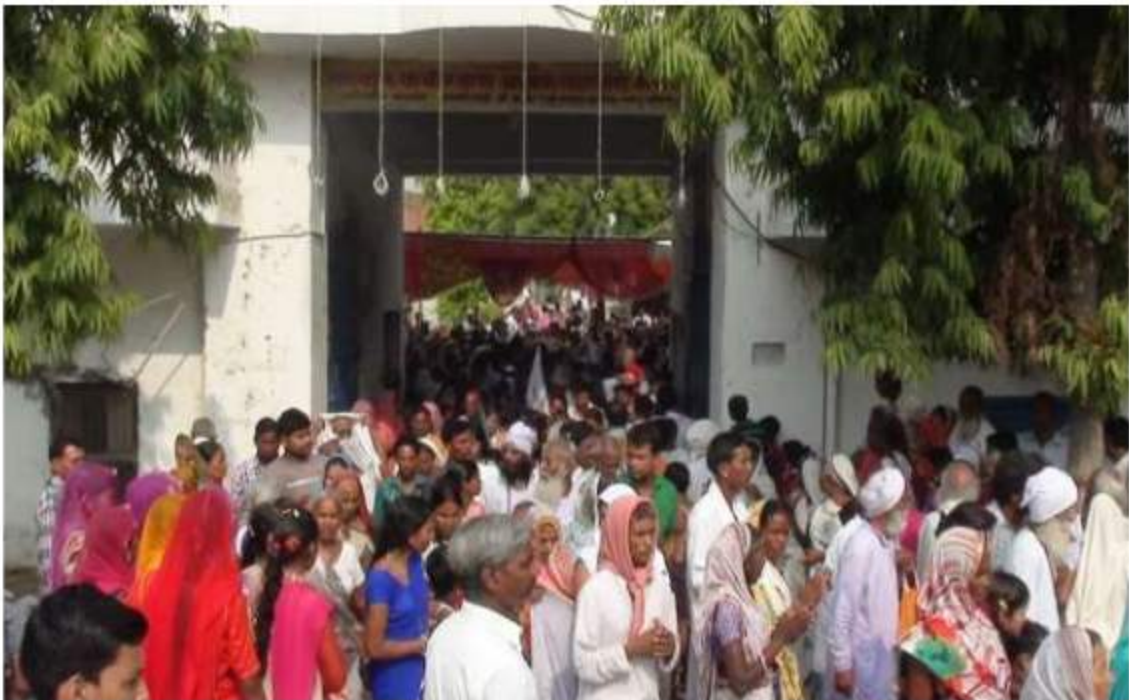
Figure 4: Sadguru Kabir Baag Ashram , Lahartara (Dharmadasi Naadvansha Kabir Math )

Sadguru Kabir Baag Ashram is located at Lahartara in Varanasi, which is known as the place of Kabir's birth or appearance. It is the most prominent branch of Kharsiya Acharya Gaddi (Shri Kabir Dharma Sthan, Kharsiya) which is the headquarters of Dharmadasi Naadvansha sect. This Acharya Gaddi was founded in 1933 at Kharsiya, Raigarh in Chhattisgarh because of a split from Damakheda, the headquarters ( Acharya Gaddi ) of Dharmadasi Kabirpanth. I would like to first shed light on the historical background of Dharmadasi Kabirpanth and Kharsiya Gaddi before describing the history and traditions of Sadguru Kabir Baag Ashram , Lahartara.