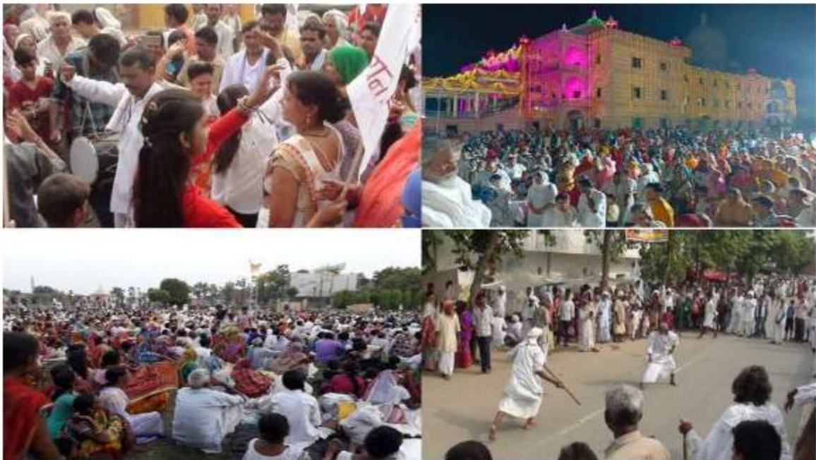
Figure 6: Celebration of Kabir Jayanti at Dharmadasi Kabir Math and Temple

Being the birthplace of Kabir, the celebration of Kabir Jayanti at the Lahartara Math becomes more important. Generally, here Kabir Jayanti is celebrated for three days. Kabirpanthis start gathering at Lahartara Math four or five days before the Kabir Jayanti. The followers of different Kabirpanthi sects and their affiliates from Bihar, Uttar Pradesh, Madhya Pradesh, Maharashtra, Gujarat, Haryana, Panjab, Rajasthan, Bihar, Jharkhand, Chhattisgarh and other states of India gather here. Majority of the Kabirpanthis come from Bihar.