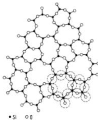
Fig. 1.3. An arbitrary \text{SiO}_2 matrix is represented in two dimensions[2]. (From the illustrated plane, the fourth bonds of the Si might protrude either upward or below and dashed lines on the lower right represent the oxygens' relative surface area needs.)

systems. These pipes keep the light being transferred throughout vast distances brilliant and intense. During the 1970s, glass that securely safeguarded radioactive wastes for thousands of years was also manufactured. Most glasses sold in stores are made of silica and other oxides. The kind of glass is determined by the kind, amount, and existence of one or more oxides; which also significantly impact the qualities and applications of glass. By way of example, introducing a transition metal oxide (cobalt oxide for blue glass, iron oxide for green glass) results in colored glass. Titanium oxide is added to heated glass to create crystalline glass ceramics.