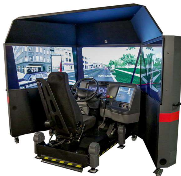
Figure 5.2. Simulator Training