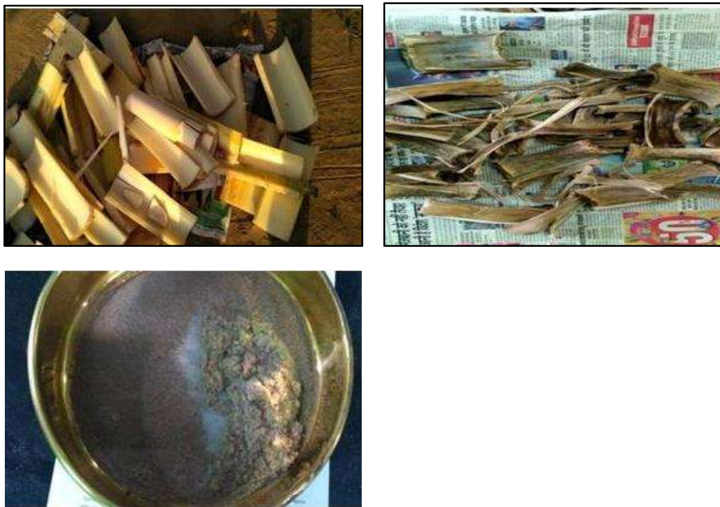
Fig. 3.1(a) Layers of banana pseudostem; (b) Layers after drying; (c) Pulverised and sieved BPF