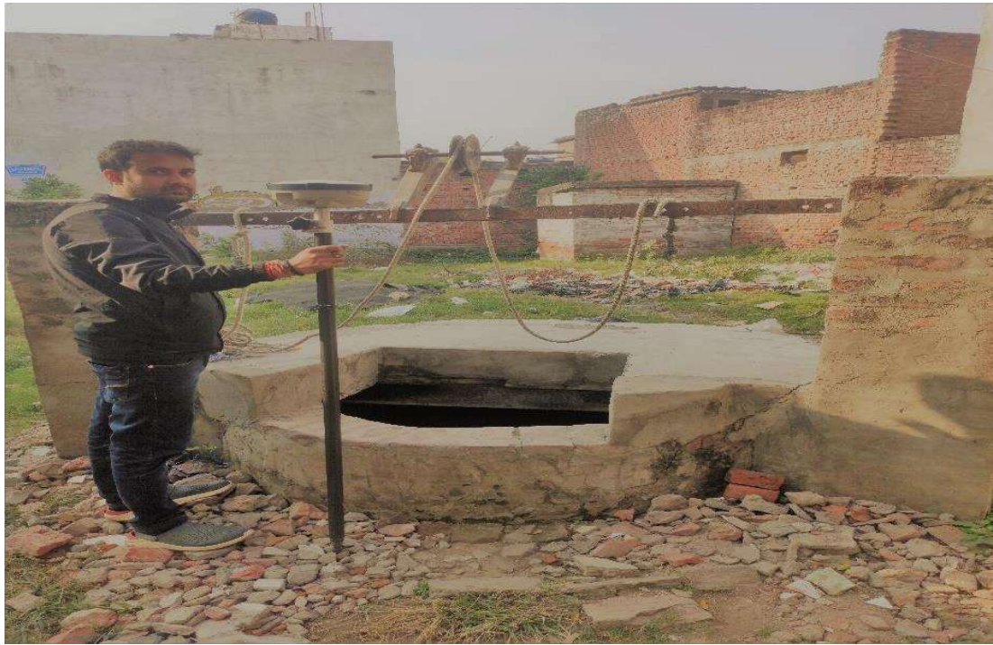
Figure 3.2 Location of the well in the study area (Dafi Site)