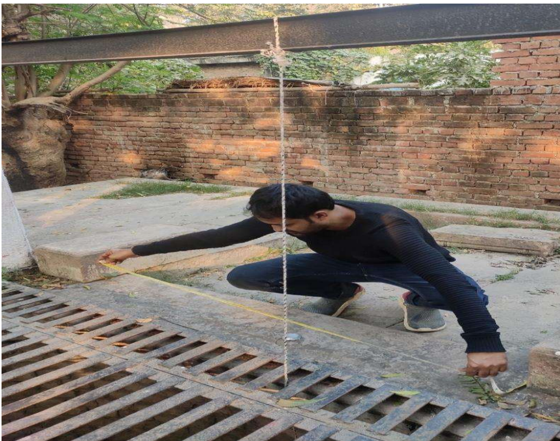
Figure 3.5 Location of the well in the study area (Vyass Chakki)