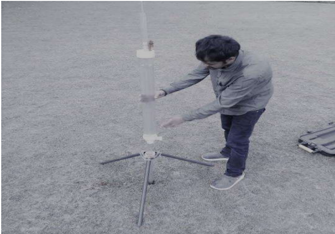
Figure 3.4 Soil infiltration test in the study area