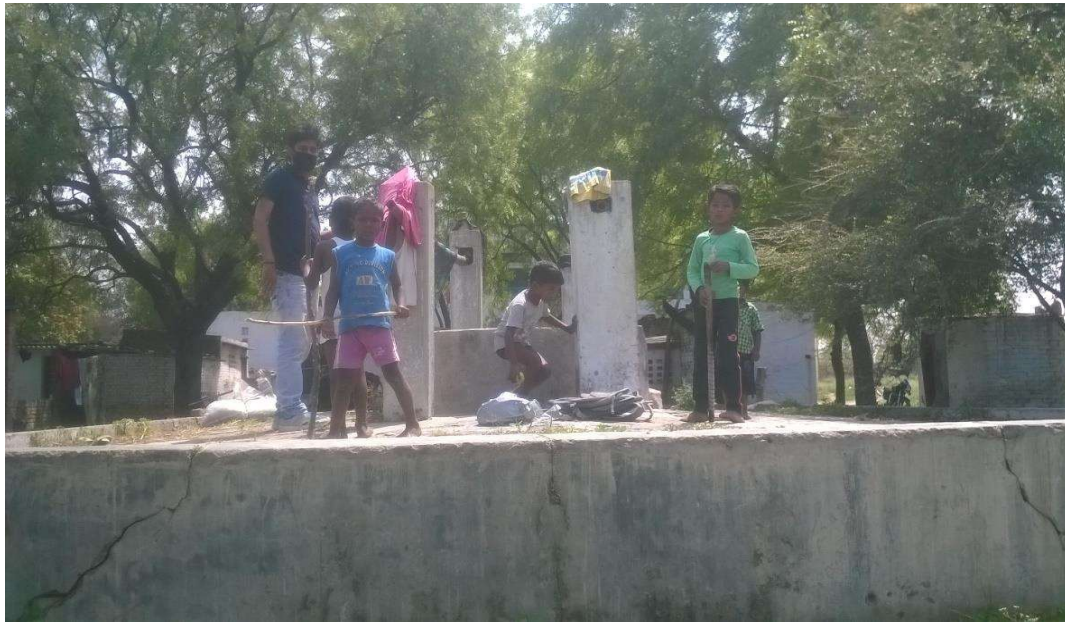
Figure 3.6 Location of the well in the study area (near Varuna)