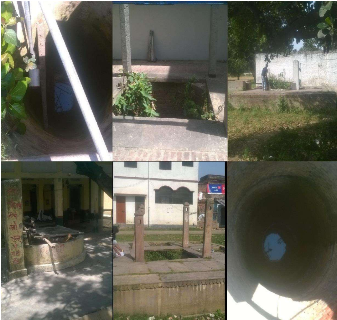
Figure 3.7 Location of the well in the study area at different locations