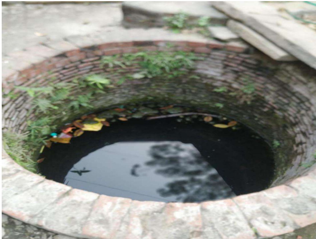
Figure 3.3 Location of the well in the study area (Cant Site)