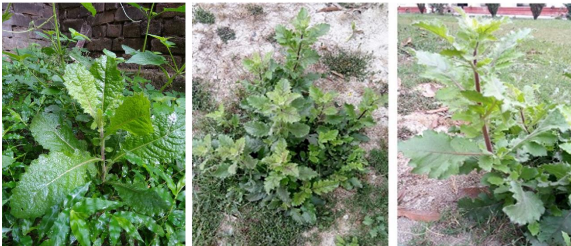
Figure 2. 2: Young and mature plant of Blumea lacera (Burm.f.) DC showing leaf, stem and flower buds.

Blumea lacera (Burm.f.) DC. is an annual herb with a strong odor, distributed throughout the plains of northwest India, up to an altitude of 2,000 m. A herbaceous plant, tomentose, capitula in axillary and terminal dense to lax panicles, achene, ribbed, pappus whitish, camphor-like odor, highly variable, in grassland, field, roadside and forest edge. The stems of this hairy or glandular herb are erect, simple or branched, very leafy and 1-2 ft in height. The leaves are obovate or oblanceolate, 5-12 cm long, 2-6 cm wide, smaller toward the top, stalked, and toothed or (rarely) lobulated at the margins, leaves are eaten as a vegetable. The bright yellow flowering heads are about 8 mm across, borne on short axillary cymes, and collected in the terminal, spike-like panicles. The involucre-bracts are narrow and hairy. The achenes are not ribbed, are somewhat 4-angled, and are smooth.